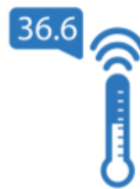
Body Temperature Check