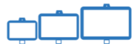
3 sizes available 10, 15 and 21 inch